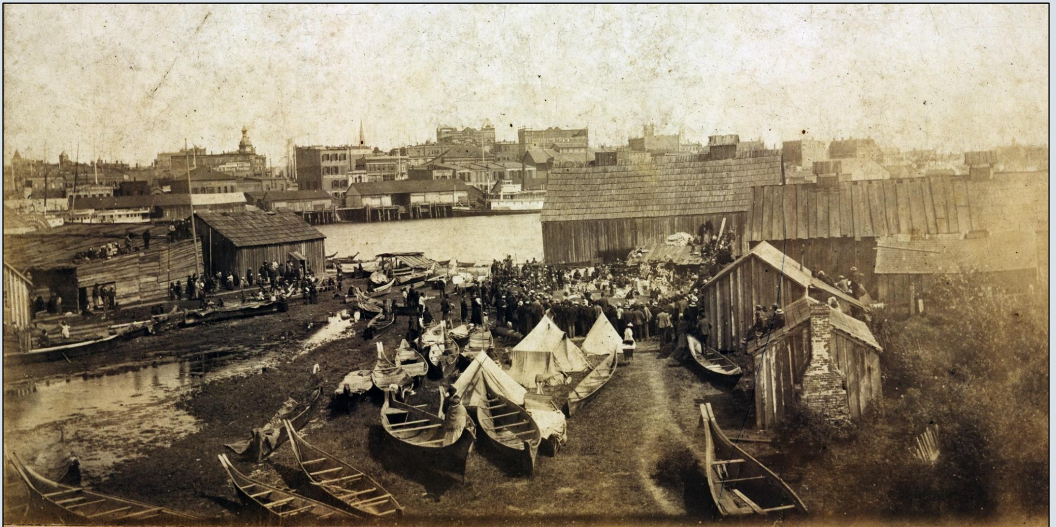
Songhees First Nations Potlach on the site of the former reserve, west side of the Johnson Street Bridge, 1895

Evidence of First Nations settlement in the area now called Saanich dates back over 4,000 years. The District of Saanich lies within the traditional territories of the Ləkʷəŋən peoples known today as Songhees and Esquimalt Nations, and the ƵSÁNEĆ peoples known today as ƵJOŁEŁP (Tsartlip), BOKÉĆEN (Pauquachin), SƆÁUTƵ (Tsawout), ƵSIKEM (Tseycum) and MÁLEXEŁ (Malahat) Nations. Each group formed a distinct nation within their own territory and their historical connections with the land continue to this day.