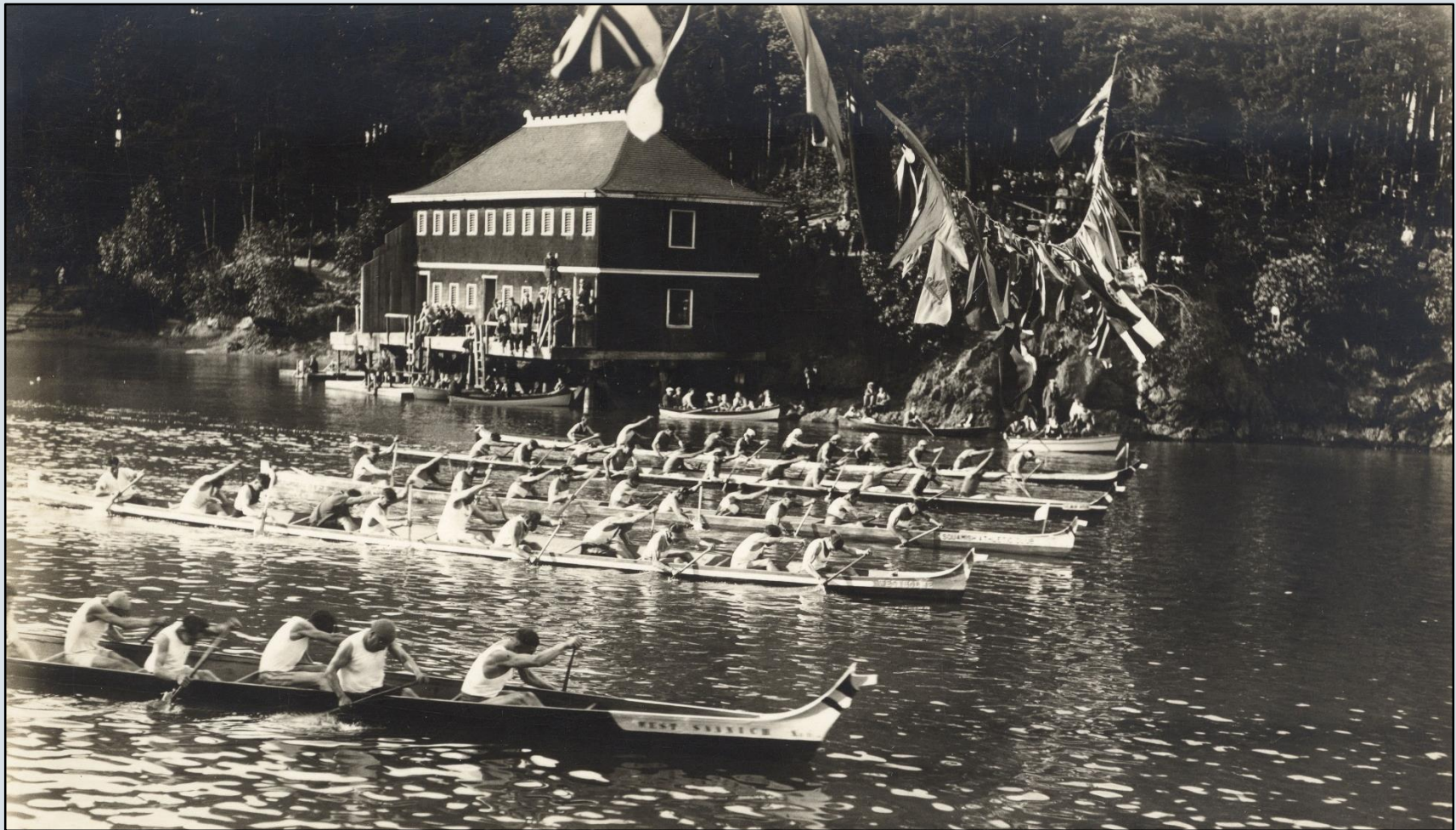
First Nations canoe race on the Gorge, 24 May 1932

Most competitors came from reserves in the Victoria area including Sooke, Saanich Peninsula, and the Cowichan Valley. Visiting First Nations crews camped along the shore of the old Songhees Reserve in what is now Vic West, and spent part of their time attending potlatches and sunrise ceremonies.