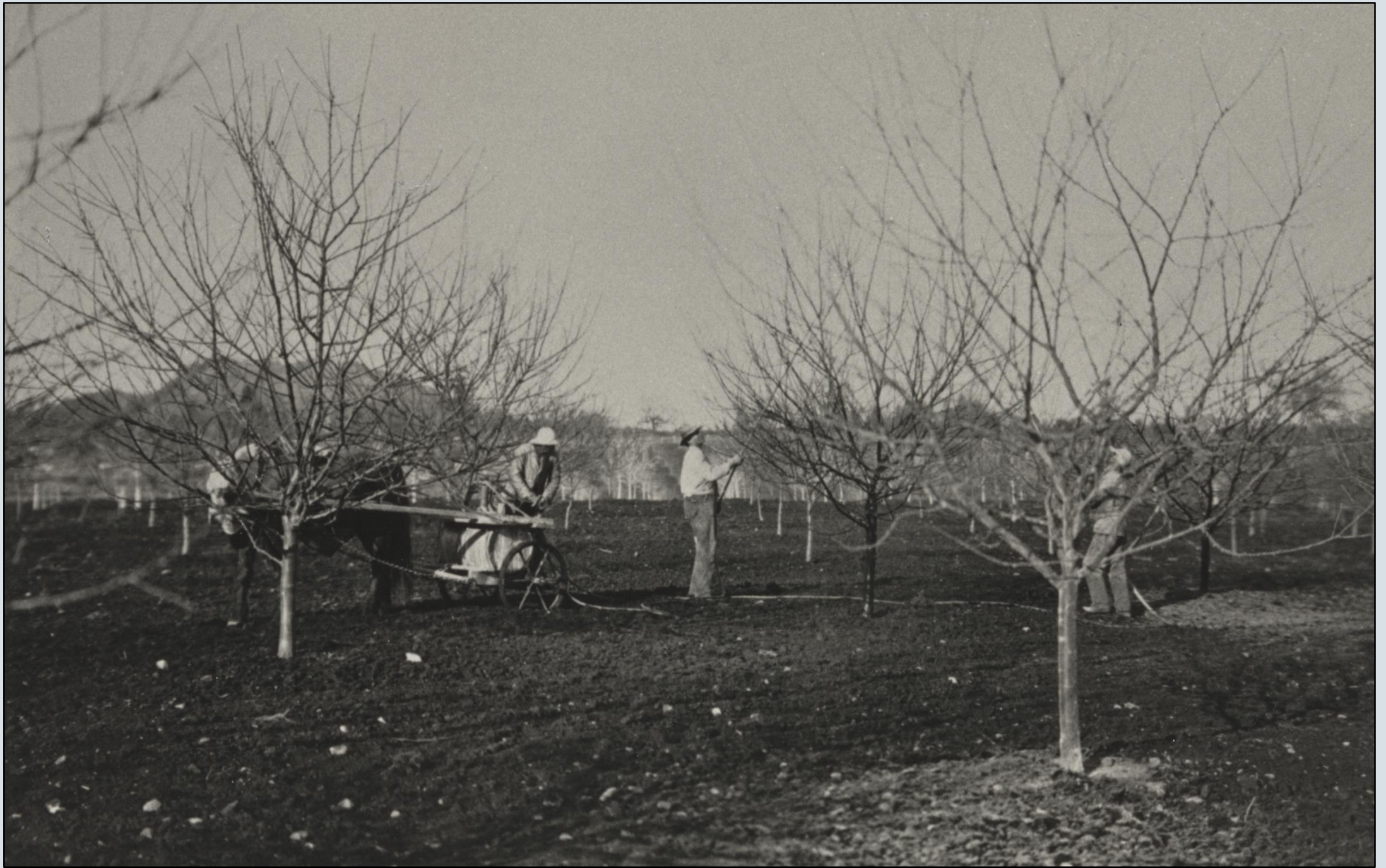
Unidentified Chinese labourers working the spray rig on the Borden Orchard, ca. 1910s