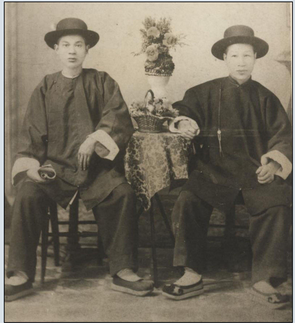
Portrait of unidentified Chinese cook and foreman of Broadmead Farm, taken on Chinese New Year, 1893

In 1872, the BC Legislature passed the first law to disqualify Chinese from voting in provincial elections. In 1895, new legislation made qualifying to vote in the federal election dependant on the provincial voters’ list. Having been stripped of their provincial voting rights, this meant that Chinese Canadians lost the federal vote too. They did not win back their right to vote until 1947 when the federal Chinese Immigration Act , also known as the Chinese Exclusion Act , was repealed.