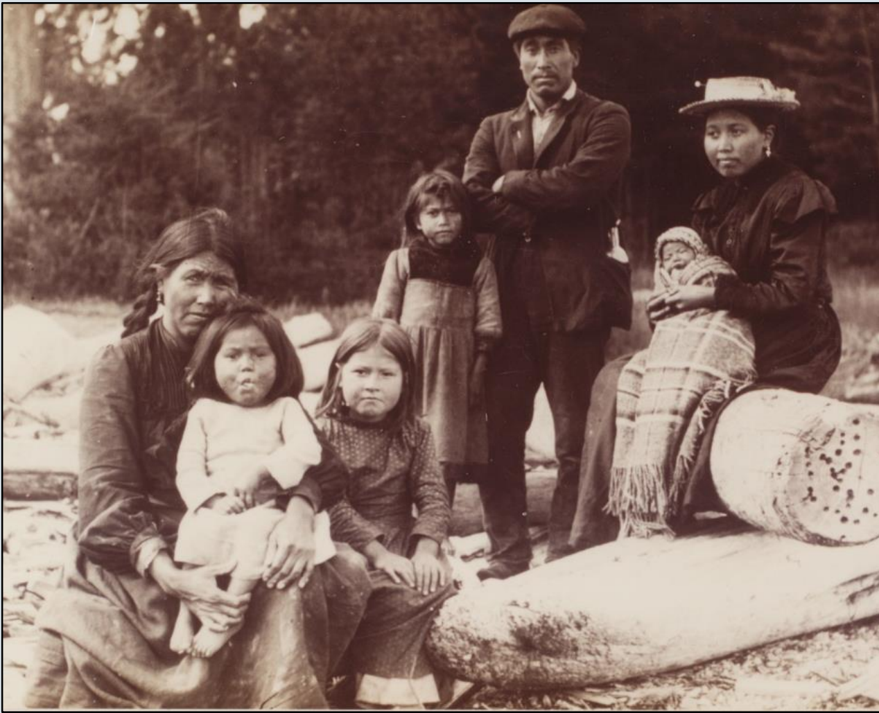
Unidentified First Nations family in Sidney, 1900