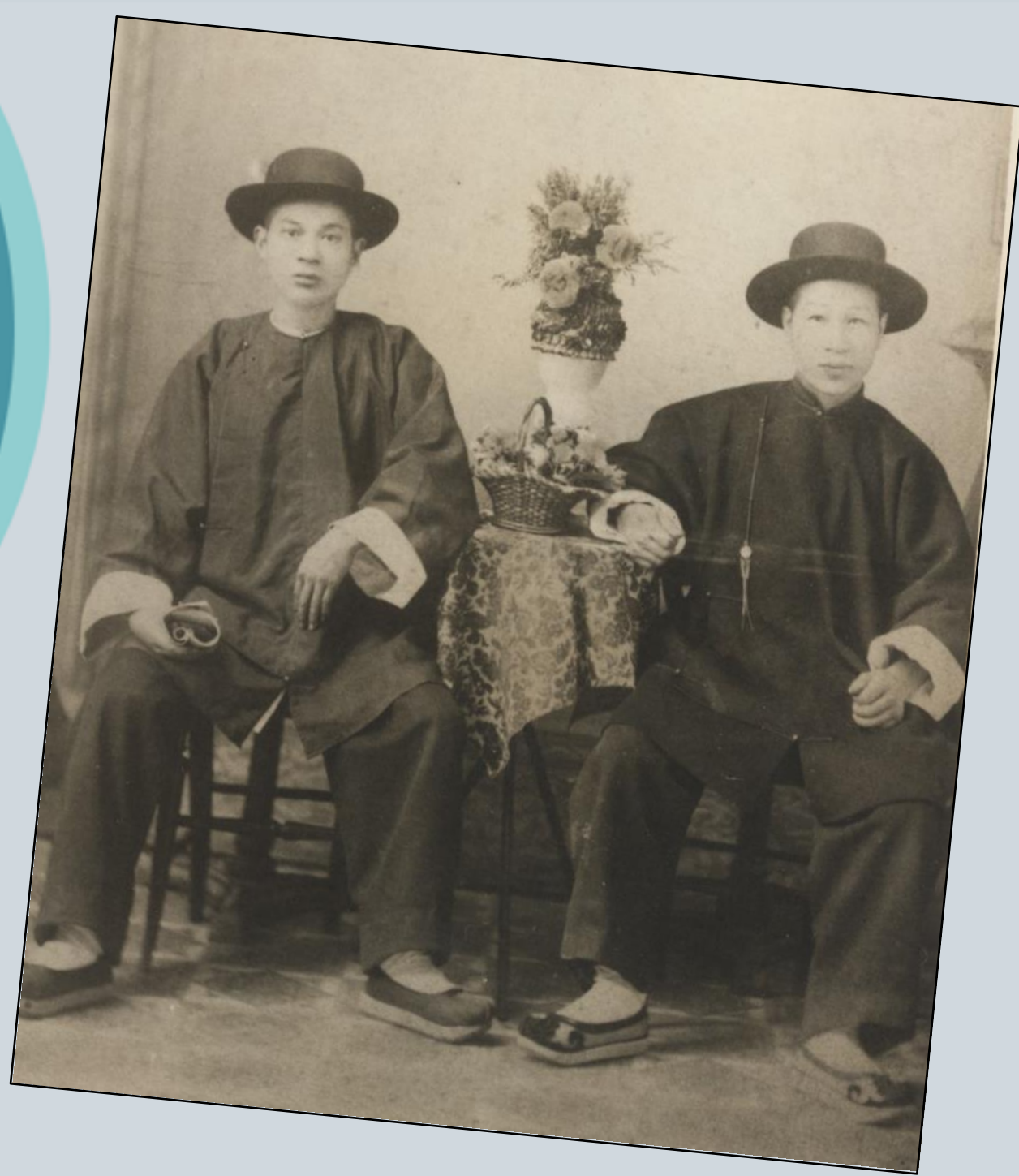
Portrait of unidentified Chinese cook and foreman of Broadmead Farm, taken on Chinese New Year, 1893

Diversity has existed on the Saanich Peninsula since long before the first Europeans arrived and for nearly 200 years, immigrants from across the world have chosen to make this area their home.