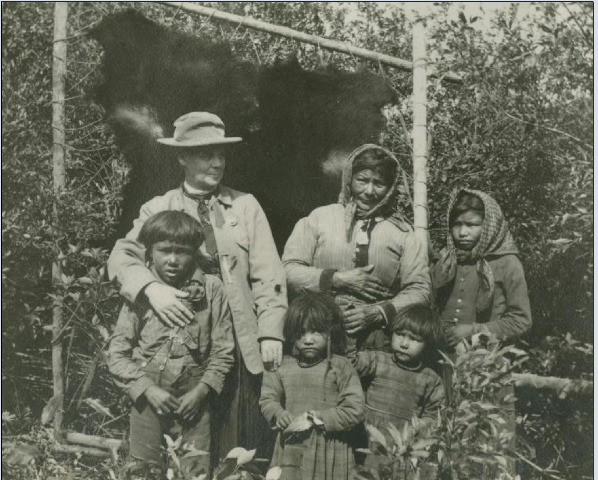
Agnes Deans Cameron with an unidentified First Nations family, 1908