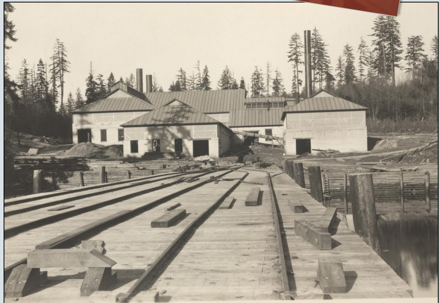
Butchart Cement Plant, 1904