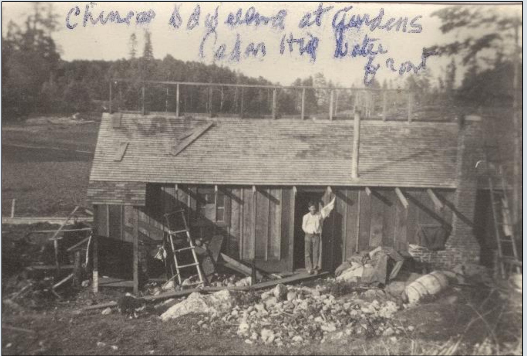
Chinese dwelling on McMorran Farm, ca. early 1900s