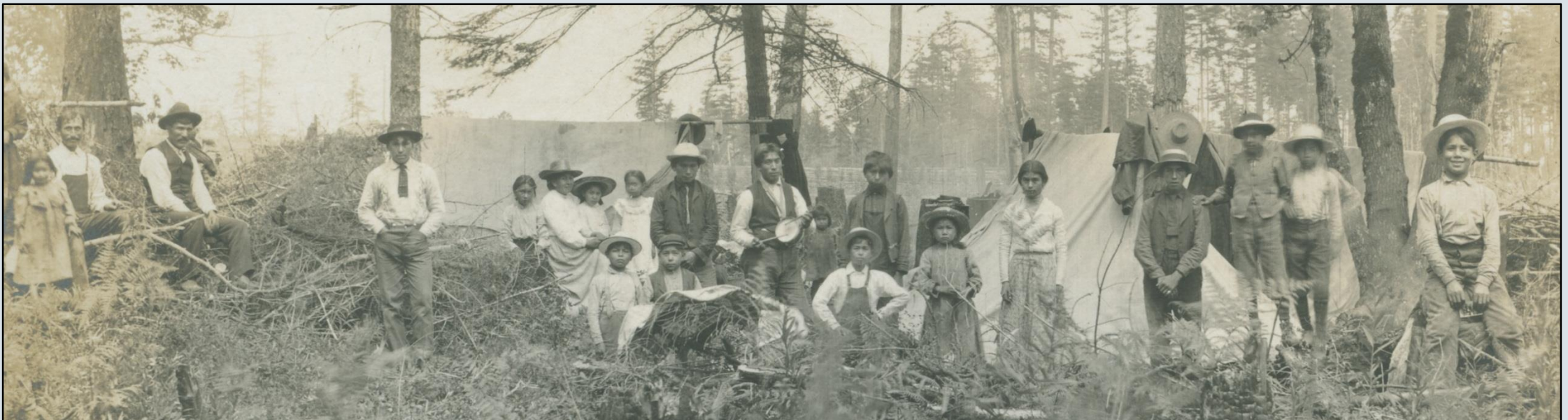
Top: Unidentified First Nations strawberry pickers on the Vantreight Farm in Gordon Head, 1906 Middle: Unidentified First Nations strawberry pickers on the Vantreight Farm in Gordon Head, 1910 Bottom: "Berry Pickers Camp", Gordon Head (probably Vantreight Farm), 1910