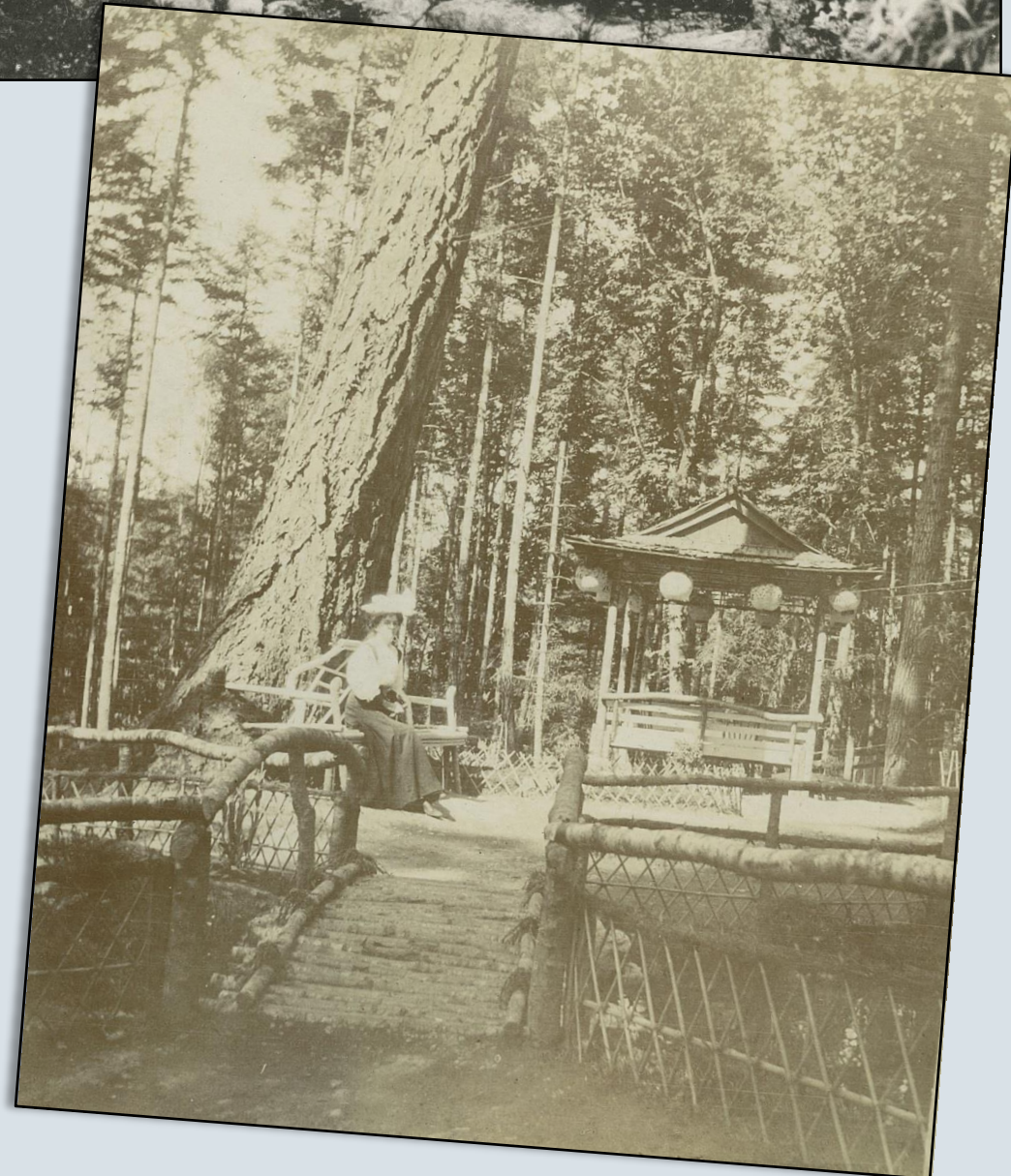
Japanese Tea Garden, ca. 1910s