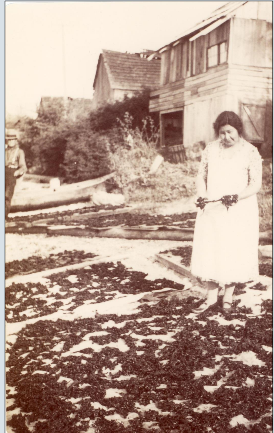
Unidentified First Nations woman drying seaweed, 1904